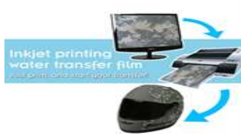
Figure: Inkjet Printer

A colored film made of PVC is prepared by rotogravure printing process or inkjet printer. The film having a graphic pattern to be transferred is insoluble in water.