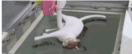
Figure: Object Dipping (Automatically)