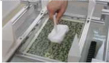
Figure: Object Dipping (Manually)