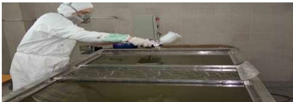
Figure: Ink Activation by Spraying a specific Reagent

A printed color film is placed on the surface of water in tank and then a chemical reagent is sprayed by sprayer manually or automatically. During this process the colored ink starts floating on water and base of film is settled down. Therefore the graphic pattern to be printed is formed in this stage.