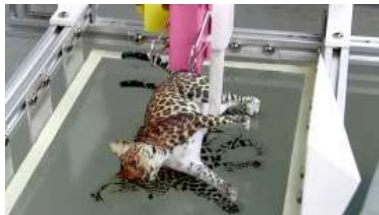
Figure: Colored ink Transfer

This step is the main among the steps because of transferring ink to object. In this stage, the floating colored ink on water transfer to the three dimensional objects. As the object is gradually immersed into the water through the floating ink film that stretches and wraps around the surface of object and adheres to objects.